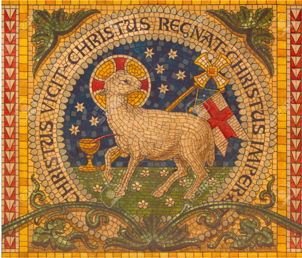
Lamb of God mosaic altar, little chapel Capella Pinardi, Turin, Italy.