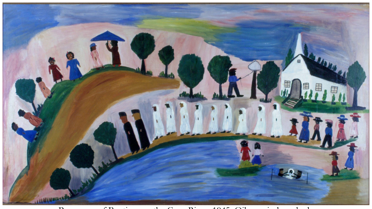
Panorama of Baptism on the Cane River, 1945, Oil on window shade Clementine Hunter, Ogden Museum of Southern Art