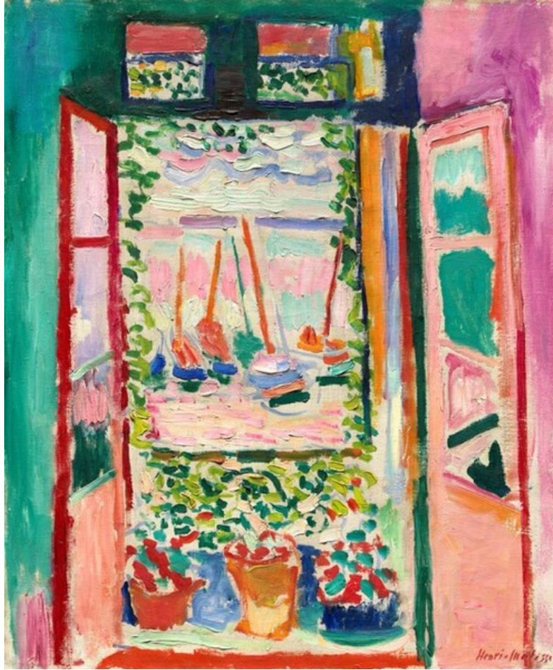
Open Window, Collioure , oil on canvas National Gallery of Art, East Building, Washington, D.C. Matisse, Henri (1869-1954)