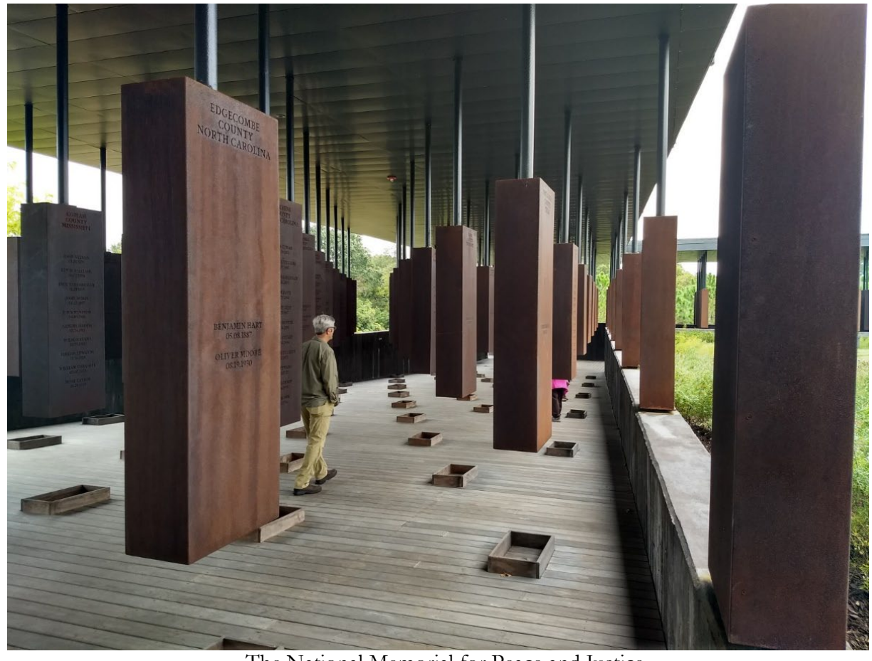
The National Memorial for Peace and Justice Montgomery, Alabama

Second Sunday of Easter April 16, 2023 10:45 a.m.