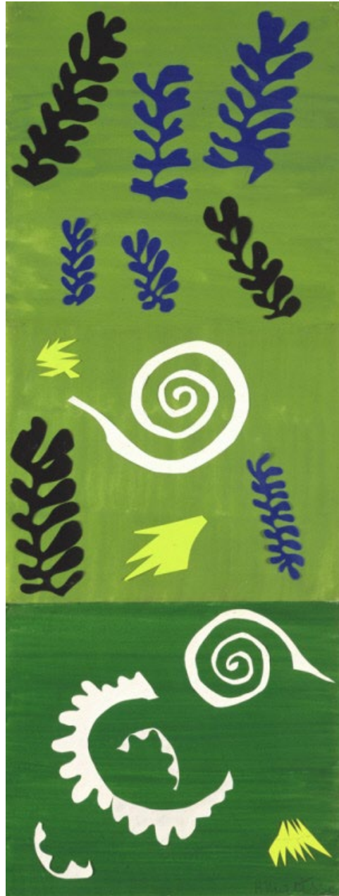
Composition Green Background, Gouache, cut papers, and pencil on paper The Menil Collection, Houston, TX Matisse, Henri (1869-1954)