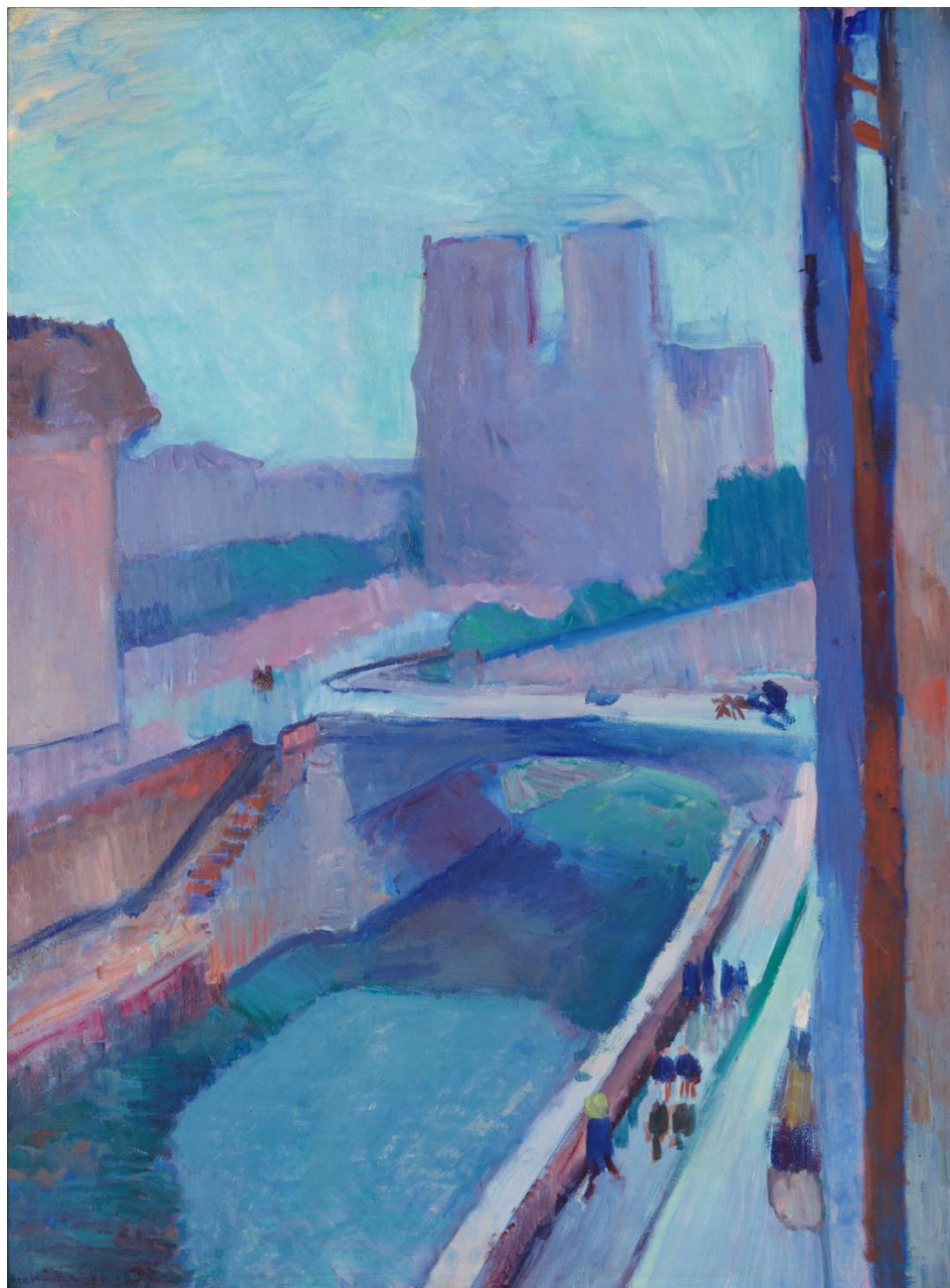
A Glimpse of Notre Dame in the Late Afternoon , oil on paper mounted on canvas Buffalo AKG Art Museum, Buffalo, NY Henri Matisse, (1869-1954)