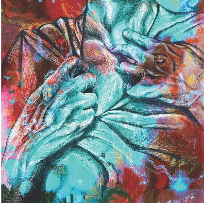
Break Open, digital painting with mixed media collage Lisle Gwynn Garrity