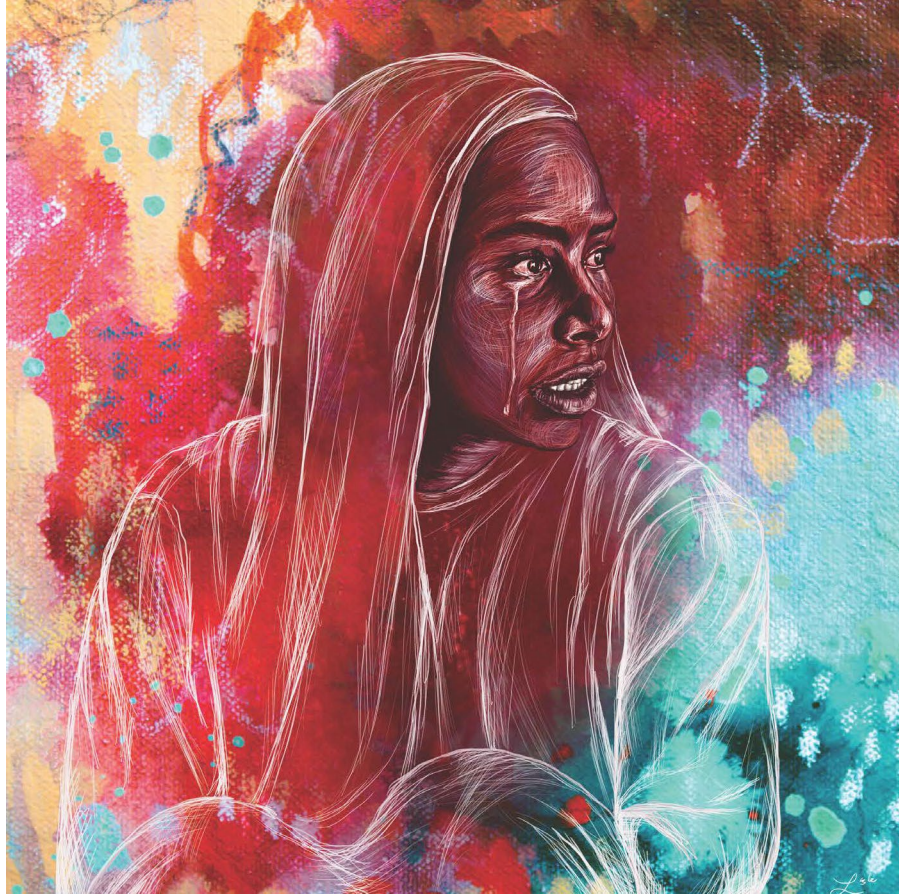
Seen , digital painting with mixed media collage Rev. Lisle Gwynn Garrity